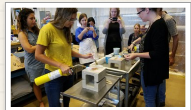
Workshop participants during the practical session.