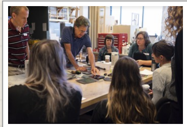
Workshop participants during lecture.